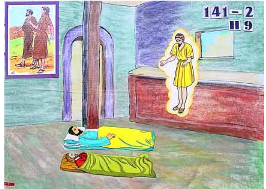
In a night vision, a man from Macedonia requests Paul to go and help. Patch: Paul and Silas leave for Macedonia.