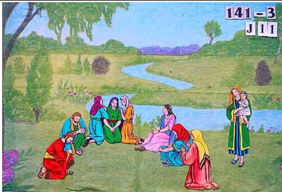
Paul and Silas find women praying at the side of the river.